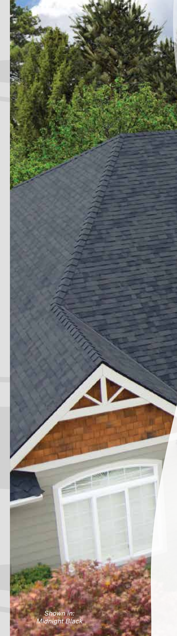
Shown in: Midnight Black

TESTING, APPROVALS, & WARRANTY •ASTM D7158 Class H •ASTM D3462 •ASTM D3161 Class F •ASTM D3018 Type I •ASTM E108 Class A Fire Rating •CSA A123.5 •ICC Approval – ESR 3150 •FBC Approval – #14809 •12-year Right Start™ Warranty •LIMITED LIFETIME WARRANTY available. For more information, visit: WWW.MALARKEYROOFING.COM