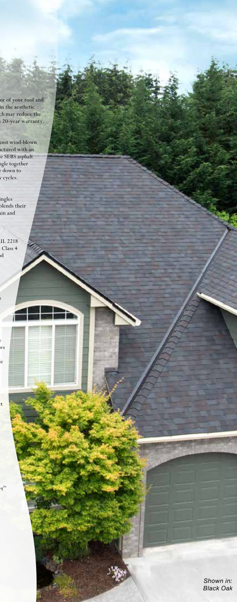
Shown in: Black Oak

TESTING, APPROVALS, & WARRANTY •ASTM D7158 Class H •ASTM D3462 •ASTM D3161 Class F •ASTM D3018 Type I •ASTM E108 Class A Fire Rating •UL 2218 Class 4 •CSA A123.5 •ICC Approval – ESR 3150 •FBC Approval – #14809 •15-year Right Start™ Warranty •LIMITED LIFETIME WARRANTY available. For more information, visit: WWW.MALARKEYROOFING.COM